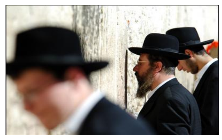
Also the controversy invokes these following additional questions.

The question thus arises, Who is Israel? Is it the nation we see today in the Middle East which was brought together in 1948 or does Israel today pertain to the United States, Great Britain and Scandinavia?